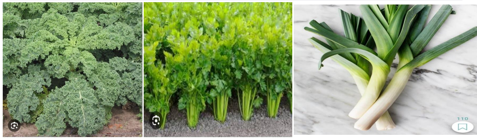
Kale (leaf cabbage)